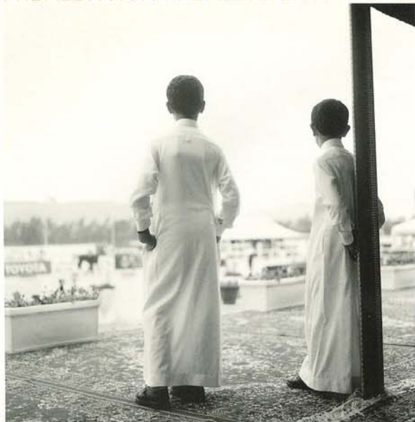
OPPOSITE PAGE, HRH CROWN PRINCE ABDULLAH BIN ABDUL AZIZ, DIRAB, KINGDOM OF SAUDI ARABIA, 1996. THIS PAGE, TOP LEFT, SAUDI ARABIA, 1996 LOWER LEFT, SHARJAH, UAE, THE CAR OF HIS HIGHNESS SHEIKH DOCTOR SULTAN BIN MUHAMMAD AL QASIMI, RULER OF SHARJAH, 1996. BELOW, ROYAL FAMILY, DUBAI, UAE, 1998.

PROFILE >>>>> PROFILE >>>>> PROFILE >>>>> PROFILE >>>>> PROFILE >>>>>