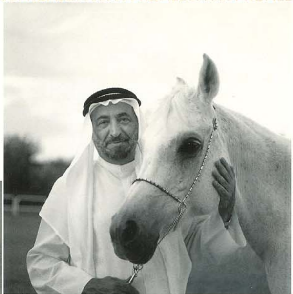
RIGHT, HRH SHEIKH DOCTOR SULTAN BIN MUHAMMAD AL OASIMI, RULER OF SHARJAH, UAE, 1996. BELOW RIGHT, A PRIVATE JET, DUBAI, UAE, 1997. BELOW, INSIDE THE AL BEWABIYA FARM OF HRH PRINCE SULTAN BIN ABDUL AZIZ, KINGDOM OF SAUDI ARABIA, 1996.